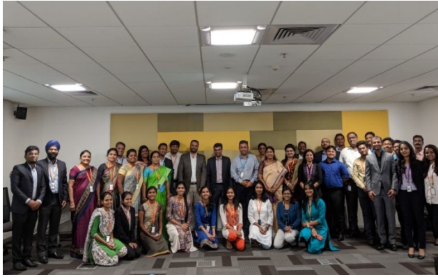
EY GDS Anchor Meet