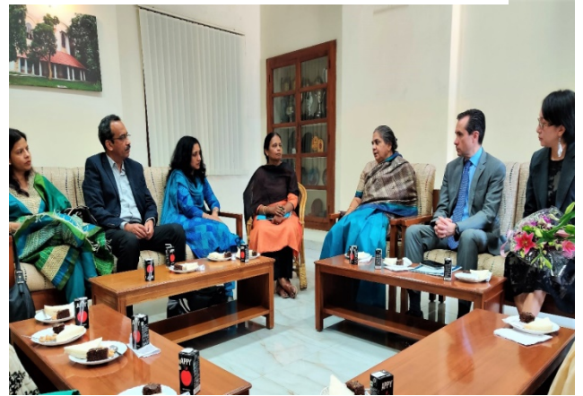
CGC interaction With World Bank Team